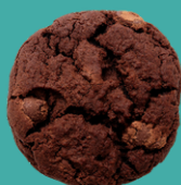
Triple Chocolate Chunk