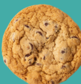
Vegan Chocolate Chip