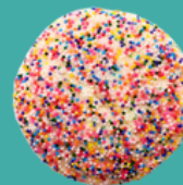
Rainbow Sprinkle (Lemon Sugar w/ Sprinkles)