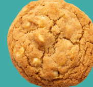
White Chocolate Macadamia

Seasonal Cookie Flavor: White Chocolate Cranberry (available 12/1 - 12/23)