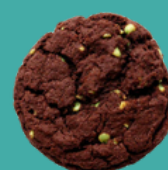
Mint-Night Chocolate (Green Mint Chips)