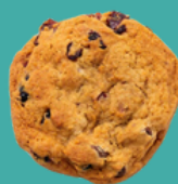
Dark Chocolate Cranberry