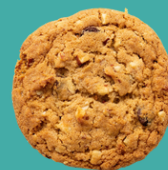
Chocolate Almond Coconut Crunch